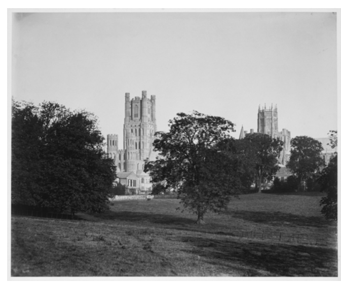
Fig. 7 Roger Fenton, photographer: view through the great park from the south, Ely Cathedral, 1857, albumen silver print, 35.7 x 44 cm, PH1976:0053, Collection Centre Canadien d'Architecture / Canadian Centre for Architecture. Montréal