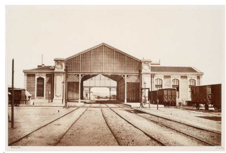
Fig. 8 Édouard Baldus, photographer: view of train station, Toulon, France, 1861 or later, albumen silver print, 27.5 \times 43.2 cm, PH1976:0009:023, Collection Centre Canadien d'Architecture / Canadian Centre for Architecture, Montréal

representation of notable buildings, especially medieval ones, became a major genre of British painters, particularly watercolourists, in the early years of the nineteenth century. Early British photographers, from Talbot on, echoed the paintings of J.M.W. Turner and John Constable, especially in their approach to ecclesiastical monuments. When Roger Fenton chose, in photographing the cathedral of Ely (fig. 7), to favour foliage over architecture in such a way that one can find out very little about the building, he must have had in mind John Constable's Salisbury Cathedral (Victoria and Albert Museum, London) rather than the interests of archivists or architectural historians