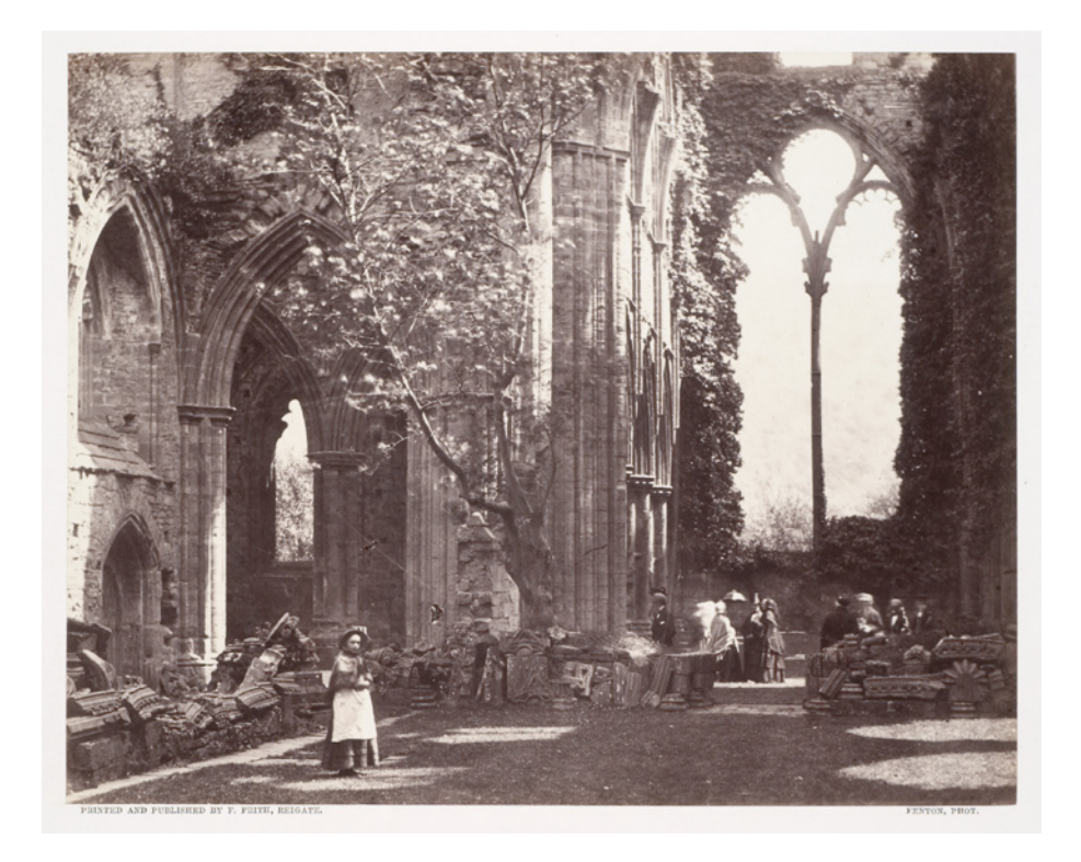
Fig. 4 Roger Fenton, photographer: interior of ruined nave looking toward east window, Tintern Abbey, Gwent, Wales, late 1850s, albumen silver print, 16.5 \times 20.9 cm, PH1983:0430, Collection Centre Canadien d'Architecture / Canadian Centre for Architecture, Montréal