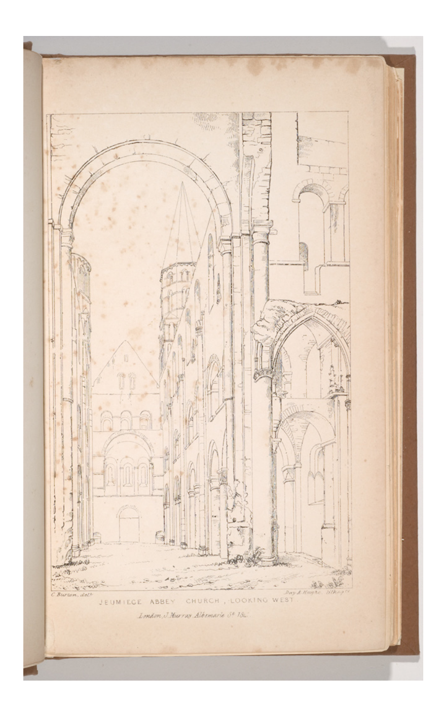
Fig. 3 C. Burton, delineator; Day & Haghe, lithographers: nave interior, Jumièges, from Henry Gally Knight, An Architectural Tour in Normandy, with Some Remarks on Norman Architecture (London: J. Murray, 1841), Call no. 1432