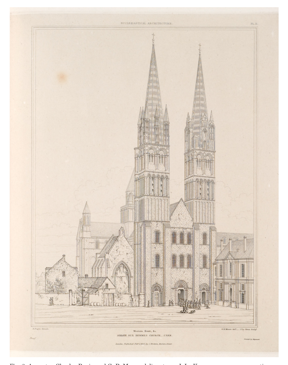
Fig. 2 Augustus Charles Pugin and G. B. Moore, delineators; J. Le Keux, engraver: perspective of western front, St. Étienne, Caen, from John Britton, The Architectural Antiquities of Normandy , London, 1828, fig. 8, Call no. W6149, Collection Centre Canadien d'Architecture/Canadian Centre for Architecture, Montréal

Church interiors presented other challenges to early photographic representation; I offer an engraving from Henry Gally Knight's Architectural Tour in Normandy, of 1841 (fig. 3.), to be compared with Roger Fenton's photograph of the ruins of Tintern Abbey (fig. 4). Most churches with intact vaulting would have been too dark to photograph with the early lenses. The engravings were inevitably more interpretive than early photographs: the technique, requiring incising fine lines into metal plates, could not convey the nuanced effects of light and shade available to the photographer, and the style and "hand" of the engraver usually exerted a greater influence on the way the object was interpreted than the disposition of the photographer. On the other hand, the camera had – and still has – limitations that did not affect the draftsman. For example, it frequently could not capture the whole of a large-scale church facade with its towers as seen from ground level - or an interior with its vaults - without distortion due to the nature of the lens, especially in sites cramped by surrounding buildings (the