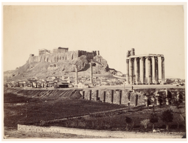
Fig. 5 Attributed to Dmitrios Constantinou, photographer: Temple of Zeus and Acropolis, Athens, ca. 1865, albumen silver print, 27.8 x 38.6 cm, PH1981:0907, Collection Centre Canadien d'Architecture / Canadian Centre for Architecture, Montréal

Indeed, the architectural photographers' models are found not only in the work of architects. The long tradition of elegiac landscape painting incorporating architectural elements, with roots in the midseventeenth century in the work of artists such as Claude Lorrain, working in Italy, and Jacob van Ruisdael in Holland, had stimulated in the late eighteenth and early nineteenth century a taste for what theorists of architecture and landscape design called "picturesque." And landscape and topographic subjects, a large portion of which involved the