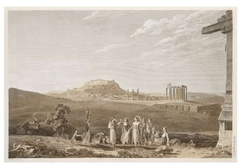
Fig. 6 William Pars, delineator; Thomas Medland, engraver: view of the Acropolis at Athens from the Agora, from James Stuart and Nicholas Revett, The Antiquities of Athens , vol. 3 (London: J. Nichols, 1794), ch. 2, pl. 1, Call no. Cage M W6130