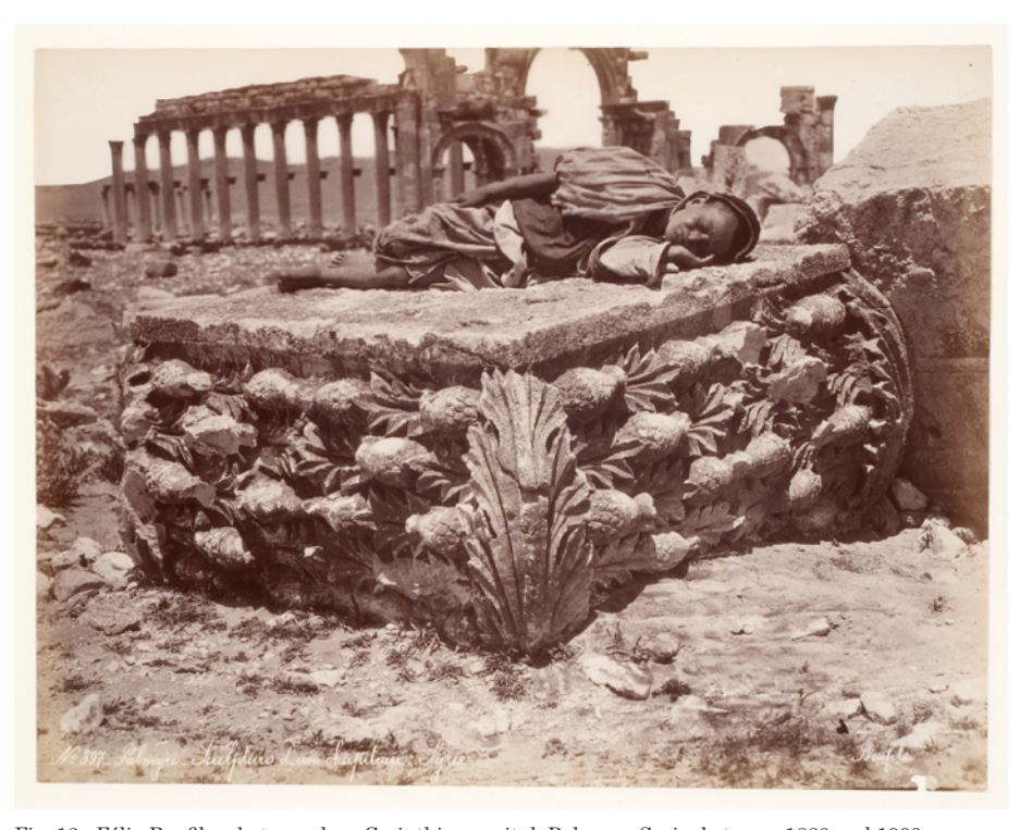
Fig. 12 Félix Bonfils, photographer: Corinthian capital, Palmyra, Syria, between 1880 and 1900, albumen silver print, 21.6 \times 27.9 \text{ cm} , PH1986:0568, Collection Centre Canadien d'Architecture / Canadian Centre for Architecture, Montréal