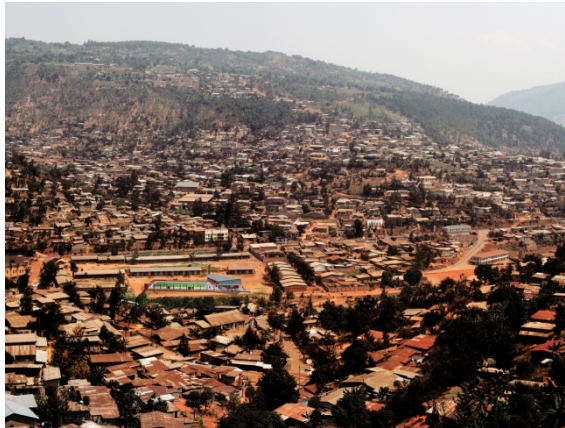
View of Kimisagara and the proposed football sports centre, Kigali, Rwanda. Concept: Architecture for Humanity / Killian Doherty.

Montréal, 15 June 2011 — The Canadian Centre for Architecture (CCA) presents The Good Cause: Architecture of Peace , an exhibition in its Octagonal Gallery examining issues arising from the reconstruction of post-war territories. The Good Cause explores the creation of lasting peace through architecture and planning projects designed to stabilize, humanize, and rebuild cities and territories devastated by armed conflict. The exhibition questions whether reconstruction can be an instrument of peace and conflict prevention, and it highlights the complexities alongside factors of success and failure involved in this process.