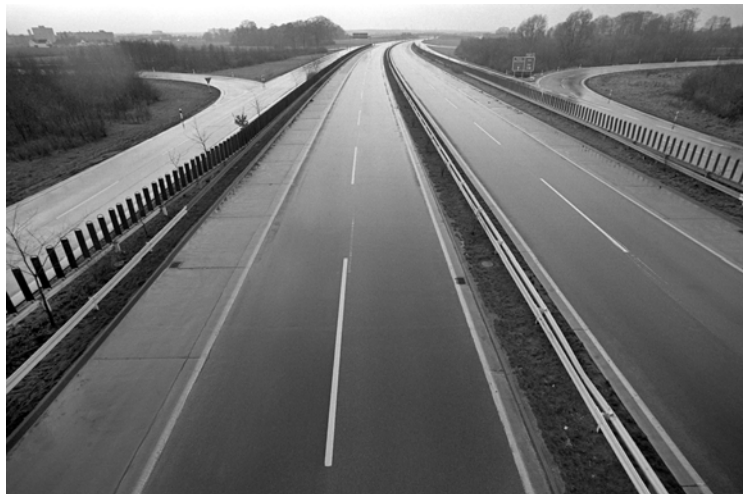
Düsseldorf-Wuppertal interchange during a driving ban, Germany, 15 November 1973.

On view from 7 November 2007 to 20 April 2008, this timely exhibition engages contemporary concerns about energy resources