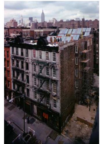
Solar collectors installed on rooftop at 519 East 11th Street, NYC.

Montréal, 10 September 2007 — The Canadian Centre for Architecture (CCA) presents 1973: Sorry, Out of Gas from 7 November 2007 to 20 April 2008. Organised by the CCA, this major exhibition and its accompanying catalogue are the first to study the architectural innovation spurred by the 1973 oil crisis, when the value of oil increased exponentially and triggered economic, political, and social upheaval across the world. Featuring over 350 objects including architectural drawings, photographs, books and pamphlets, archival television footage, and historical artefacts, the exhibition maps the global response to the shortage and its relevance to architecture today.