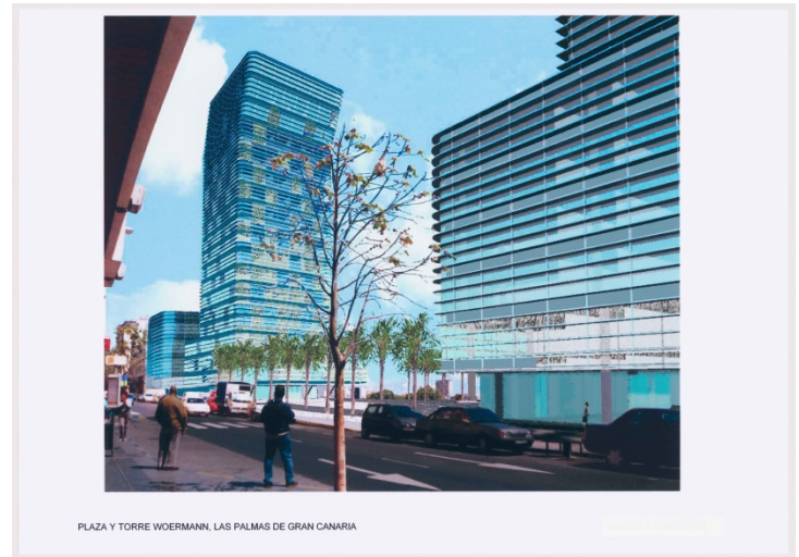
PLAZA Y TORRE WOERMANN, LAS PALMAS DE GRAN CANARIA