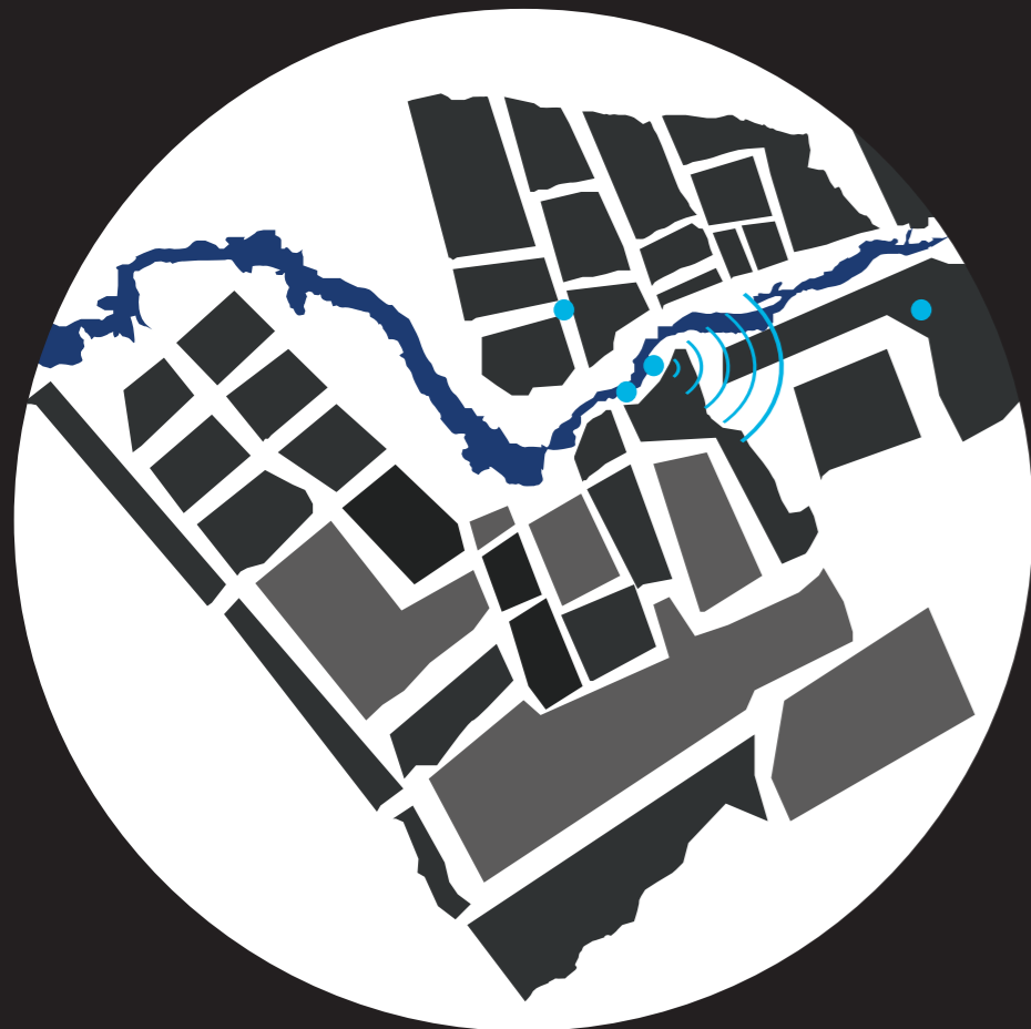
Reconciliation through Respect

Canada as a country just like many others has been defined by the culture, people, and history that occupies the land. Unlike Canada, many countries embrace the culture that developed their nation and continue traditions with minor adjustments to adapt to modern times, however; the progressive diminish of culture has extreme consequences in which the government enforces and regulates to preserve. Is this why the ruling bodies proposed and accepted the Zibi Condominium Project? Shame on them!