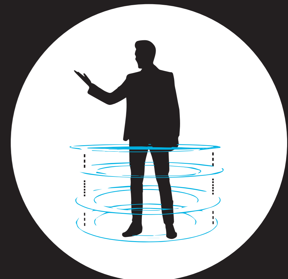
Democracy through Compactness

Individualism and protection through kit of parts and transparency of glass. There are no hidden identities. People should feel safe of voicing and proud of their opinions. The compact space focuses on the bounded area to promote a sense of security as people can feel threaten in front of powerful st