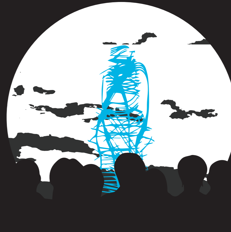
Transparency through awareness

The Wanderer represents a tactical architecture which emerges as a playing field for instruments and drivers of change. It is a machine that operates as a social disruptor through the digitization phase of architecture. Picture a machine that caters to the public voice of expression without censorship; merely the civic act of the public itself to contest and conflict. This act is then visually projected on the landscape of the parliament building to the discretion of the voice; whether in the form of graffiti or other visual taboos. The Wanderer sets out to create or enforce a dystopia.