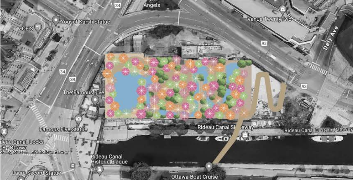
SENATE OF CANADA BUILDING 2 RIDEAU ST. OTTAWA