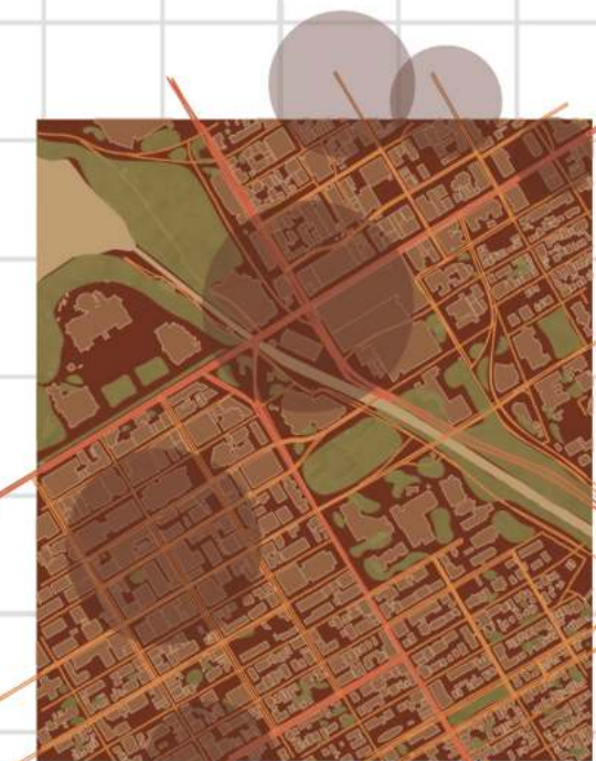
B. Unhoused Population Density