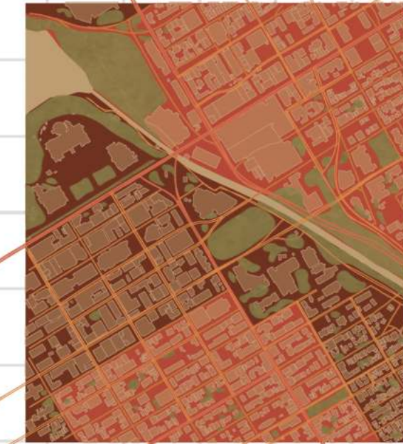
A. Low-income Population Density