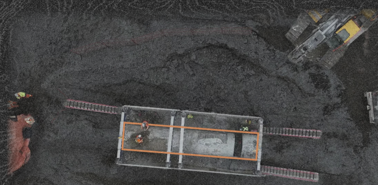
19500 BEARSPAW FEEDER MAIN (BUILT 1975)